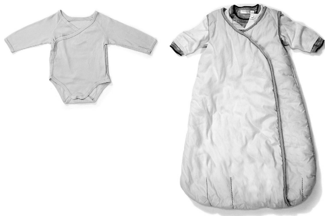
Figure 1 | Pictures of both types of clothing. Left-hand side: a baby bodysuit; right-hand side: pyjamas covered with a cardigan and a baby sleep-sack. We thank Emmanuel de Margerie (UMR6552, Rennes, France) for providing us these pictures.

Proximity of hands to head and hand postures differed between the two groups (Mann-Whitney test: hand proximity: U = 7 , P = 0.002 ; hand posture: U = 16 , P = 0.031 ): the hands of NB in bodysuit were most of the time close to their head (i.e. above chest level) and