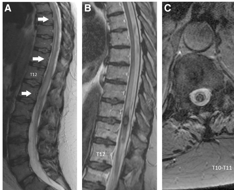
Fig. 1 Spinal MRI images of the first inflammatory event ( a ) and the hematomyelia ( b and c ). a. Sagittal T2-weighted MRI showing a high-intensity signal and enlargement of the spinal cord extending from T8 to the L1-L2 level. b. Sagittal T2-weighted turbo spin-echo MRI showing a heterogeneous low-intensity signal at the T10-T11 level. c. Transversal T2*-weighted gradient-echo MRI at the T10-T11 level confirming the intramedullary low-intensity signal: it is an intramedullary hemorrhage (hematomyelia)

cognitive impairment, inflammatory activity in the CSF (40 cells/mm 3 , protein concentration of 137 mg/dL) and multifocal lesions on a brain MRI (Fig. 2a-b). T2-fluid attenuation inversion recovery (FLAIR) and T2*-weighted gradient-echo imaging showed a low-intensity frontoparietal lesion identified as blood deposits. Steroids were increased to 1 mg/kg/day and she showed a marked improvement. Follow-up CSF analysis indicated fewer than 10 cells/mm 3 , and oligoclonal bands were found this time.