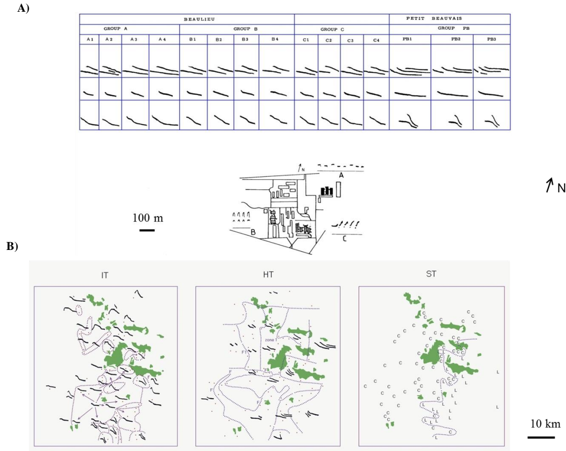
Figure 3. Complex dialectal system in the European starling observed in Rennes area. A) Comparison of class I themes (Inflection, Harmonic and simple themes) between colonies either on the same site (groups A, B, and C, 200 m apart) or further apart (15 km, Group PB). A map of site 1 (Rennes Campus University). The rectangles correspond to buildings where the nests are present (hatched or dark rectangles). The spectrograms correspond to the variant of the rhythmic theme sung by all members of the colonies considered, B) each map represents dialectal boundaries for the different types of class I whistles. Note the different level of variation for each type. IT, Inflection Theme, HT, Harmonic Theme, ST, Simple Theme and RT, Rhythmic Theme. In maps, dialectal boundaries correspond to dotted lines. The hatched areas correspond to forests. C, L, short versus long variant of ST (Hausberger, 1997).

Different levels of dialectal variations could thus be observed that did not share the same boundaries: each type had its own pattern of dialectal variation and two birds could share the same variant for one theme and not for another one. Dialectal boundaries occurred in adjacent areas without any visible habitat change that could explain a lack of transmission.