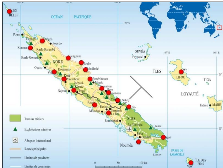
Figure 1. Map of New Caledonia showing recruitment sites, areas (NE, NW, SE, SW, Loyalty Islands) and ultramafic soils (in green) Adapted from: Carte des activités industrielles et des services de Nouvelle-Calédonie, éditions Hatier, Paris, 1990.

excluded participants with an incomplete questionnaire ( n = 3 ) or missing data for metal ( n = 11 ) or creatinine ( n = 1 ) concentrations, the analysis reported here included 731 participants.