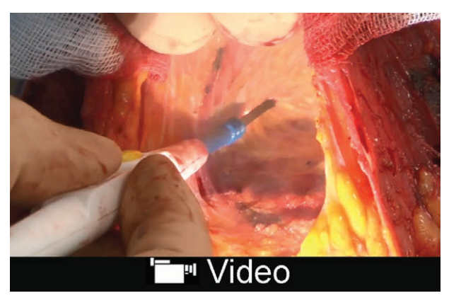
Video Graphic 3. See video, Supplemental Digital Content 3, which displays anterior contouring. This video is available in the "Related Videos" section of the Full-Text article on PRSGlobalOpen.com or available at <a href="http://links.lww.com/PRSGO/A997">http://links.lww.com/PRSGO/A997</a>.

The surgery continues with the patient positioned in a supine position. The anterior contouring starts with an infiltration of the adipose tissue using an adrenaline saline solution (1:1,000; weight/volume) and an extensive liposuction under the resection area. Skin was excised with conservation of the connective tissue. Then, a small traditional undermining above the umbilicus to the xiphoid was performed. This dissection is performed just above the fascia and extends laterally to the medial edge of the recti muscles. Thereafter, a monsplasty<sup>5</sup> with 3 nonabsorbable stitches (1 Premicron; B.Braun, Melsungen, Germany) was achieved, and the medial point was placed between Cramper's fascia and rectus aponeurosis and the 2 lateral stitches between Cramper's fascia and the periostea of the iliac crest. A hightension stitch was placed at the top of the neo-umbilicus between the dermis of the abdominal flap and the rectus fascia to reduce tension of the scar. A drain was positioned in the subumbilical undermining, and the wound closure was performed as the posterior closure by separate absorbable stitches (Polysorb 2; Covidien, Dublin, Ireland; and Monocryl 3/0; Ethicon, Inc., Somerville, N.J.) and by a running suture (Monocryl 4/0; see video, Supplemental Digital Content 3, which displays anterior contouring. This video is available in the "Related Videos" section of the Full-Text article on PRS-GlobalOpen.com or at http://links.lww.com/PRSGO/A997).