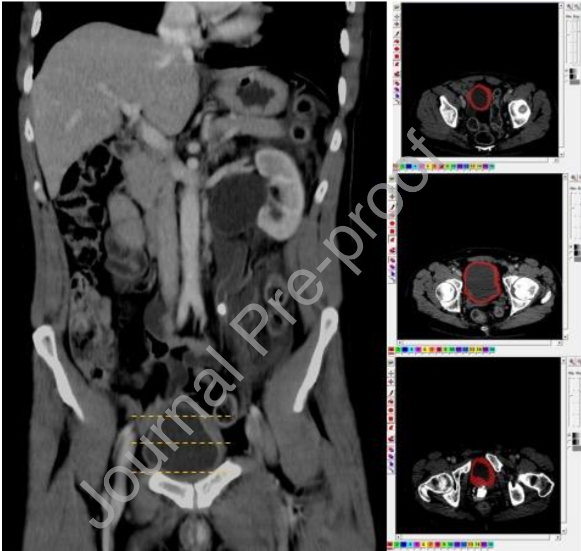
Figure 1: Illustration of lesion delineation