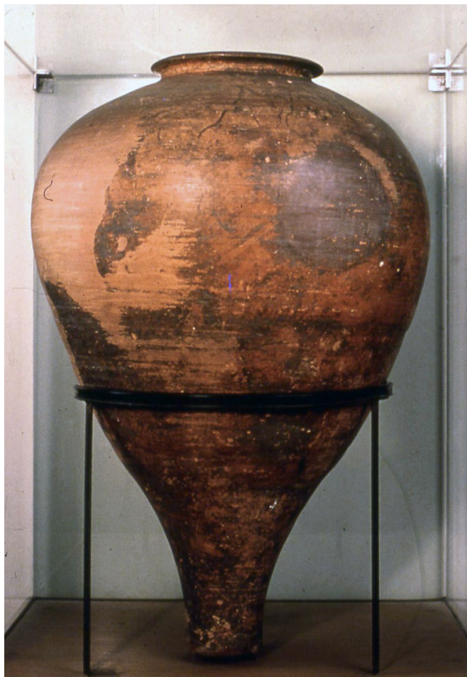
FIGURE 25.1. National Museum, New Delhi. An onion-shaped jar from Harappa, a most common large transport vessel in the Indus Civilization, of the same type as the inscribed one found at RJ-2. They made very resistant, waterproof containers, designed to fit the sharp curvilinear profile of the hull of boats, as were Roman amphorae (courtesy of the National Museum, New Delhi).

The fact that black slipped jars were produced in a specific region, the Indus basin, and were clearly intended for long distance trade, indicates that they